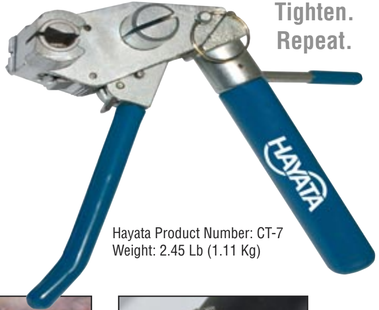
Hayata Product Number: CT-7 Weight: 2.45 Lb (1.11 Kg)

Hammerhead is Hayata-strong, designed for heavy-duty use and abuse in hard to access areas