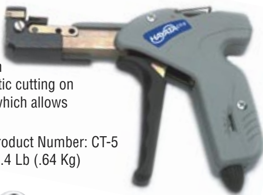
Hayata Product Number: CT-5 Weight: 1.4 Lb (.64 Kg)

Manual tool with preset tension adjustment control which can allow for uniform tension setting and automatic cutting on each bundle. Lightweight, which allows one hand operation.