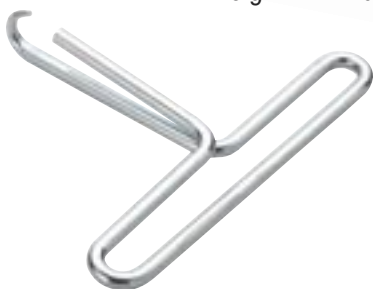
Hayata Product Number: CT-4 Weight: 0.1 Lb (.05 Kg)

Tensioning hook tool used with releaseable and ladder stainless steel ties, both coated and uncoated.