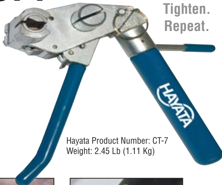
Hayata Product Number: CT-7 Weight: 2.45 Lb (1.11 Kg)